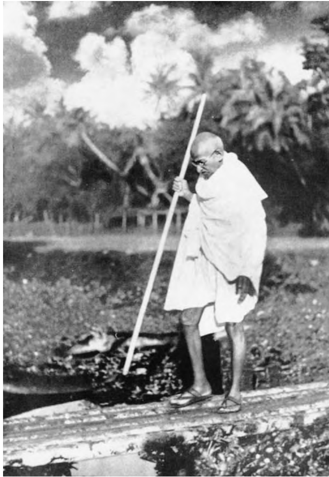
4. Gandhi walking through the riot-torn areas of Noakhali, late 1946