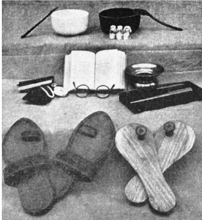
7. Gandhi's worldly possessions