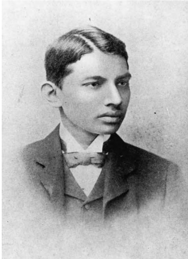
2. Gandhi as a law student in London in 1890