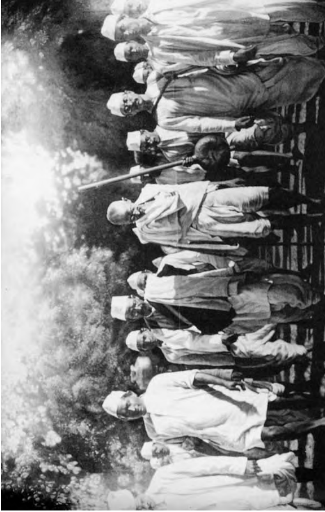
3. Gandhi on the Salt March, 12 March 1930